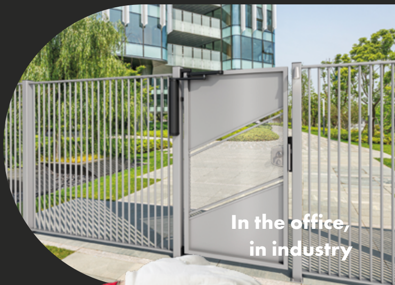
In the office, in industry