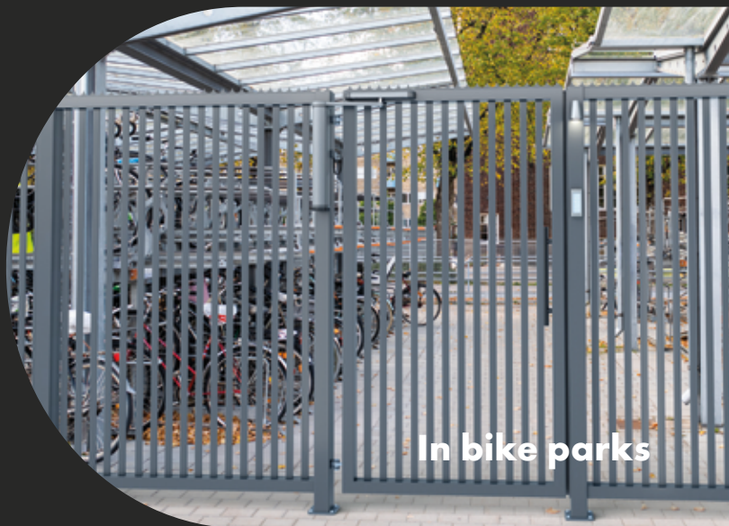
In bike parks